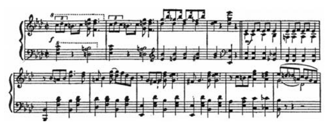
Figure 5 - A polyphonic score where different voices are present.

On the other hand, simultaneous events can occur also because they belong to other voices. When there are different simultaneous parts/voices, the translation is performed measure by measure and the start time of the measure is saved in a variable. As soon as the translation of the single voice ends, the counter is reset to the initial value previously saved.